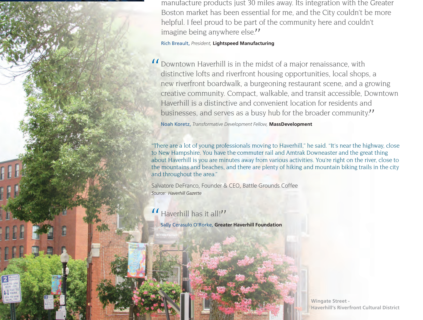
Wingate Street - Haverhill’s Riverfront Cultural District