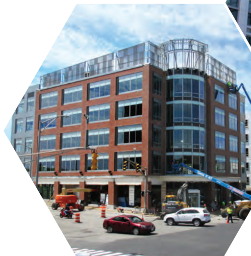
Harbor Place - UMass Lowell Campus Open 2017