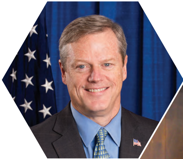
Governor Charlie Baker