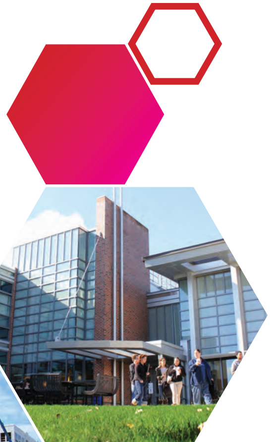
Northern Essex Community College