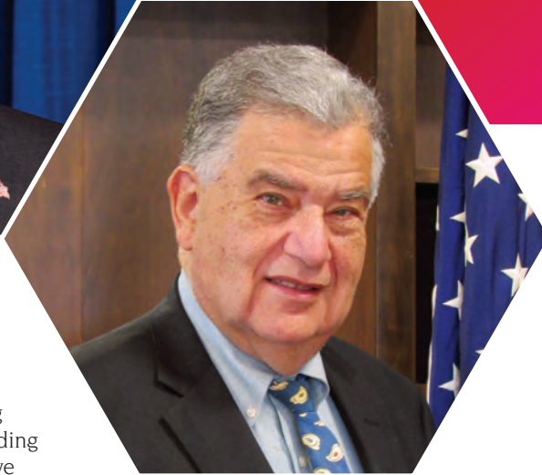
Mayor James J. Fiorentini

Governor Charlie Baker Commonwealth of Massachusetts