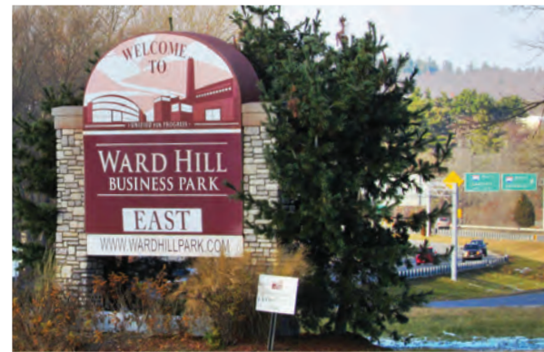
East entrance off of Rte. 495 to Ward Hill Business Park