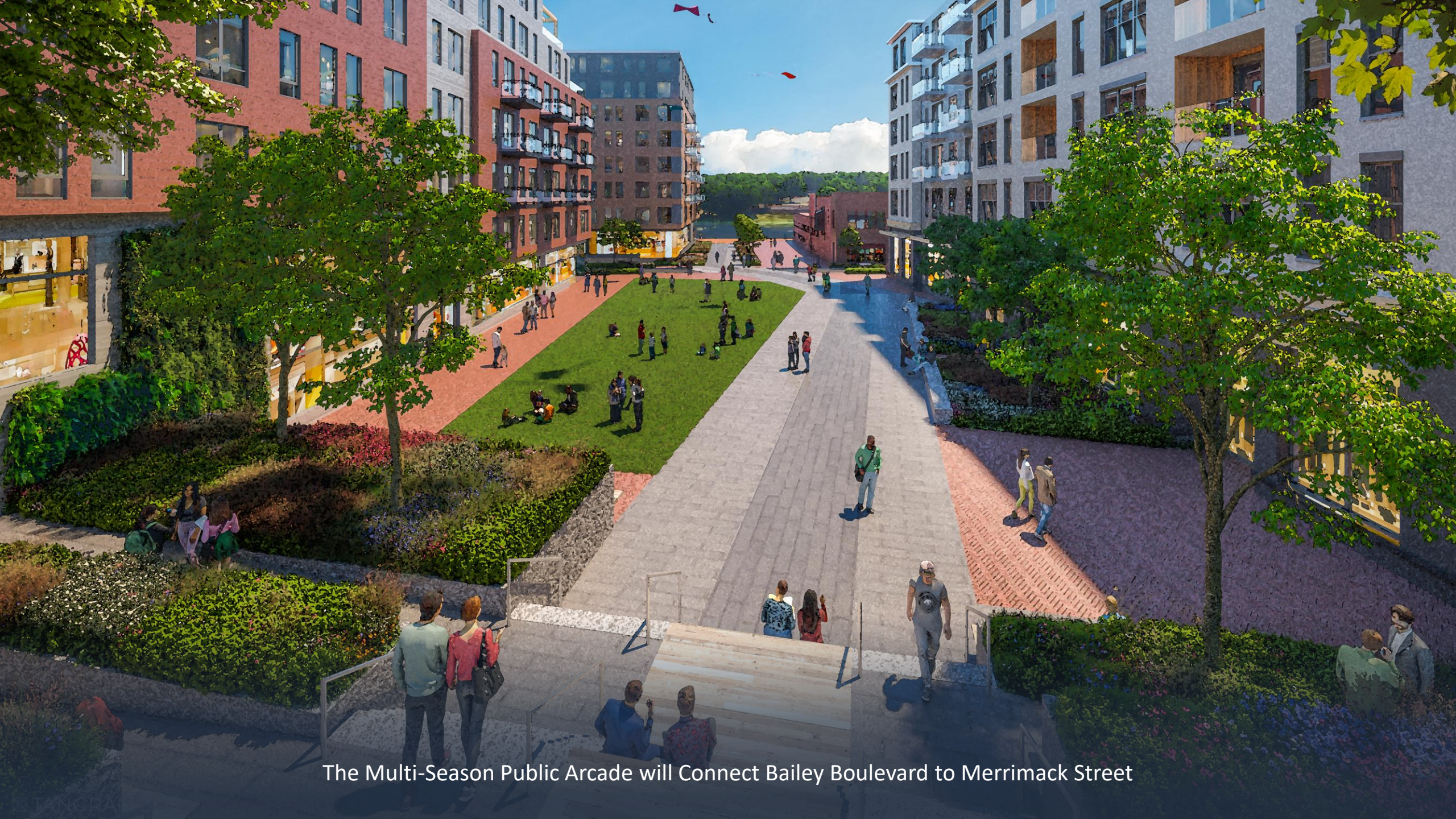
The Multi-Season Public Arcade will Connect Bailey Boulevard to Merrimack Street