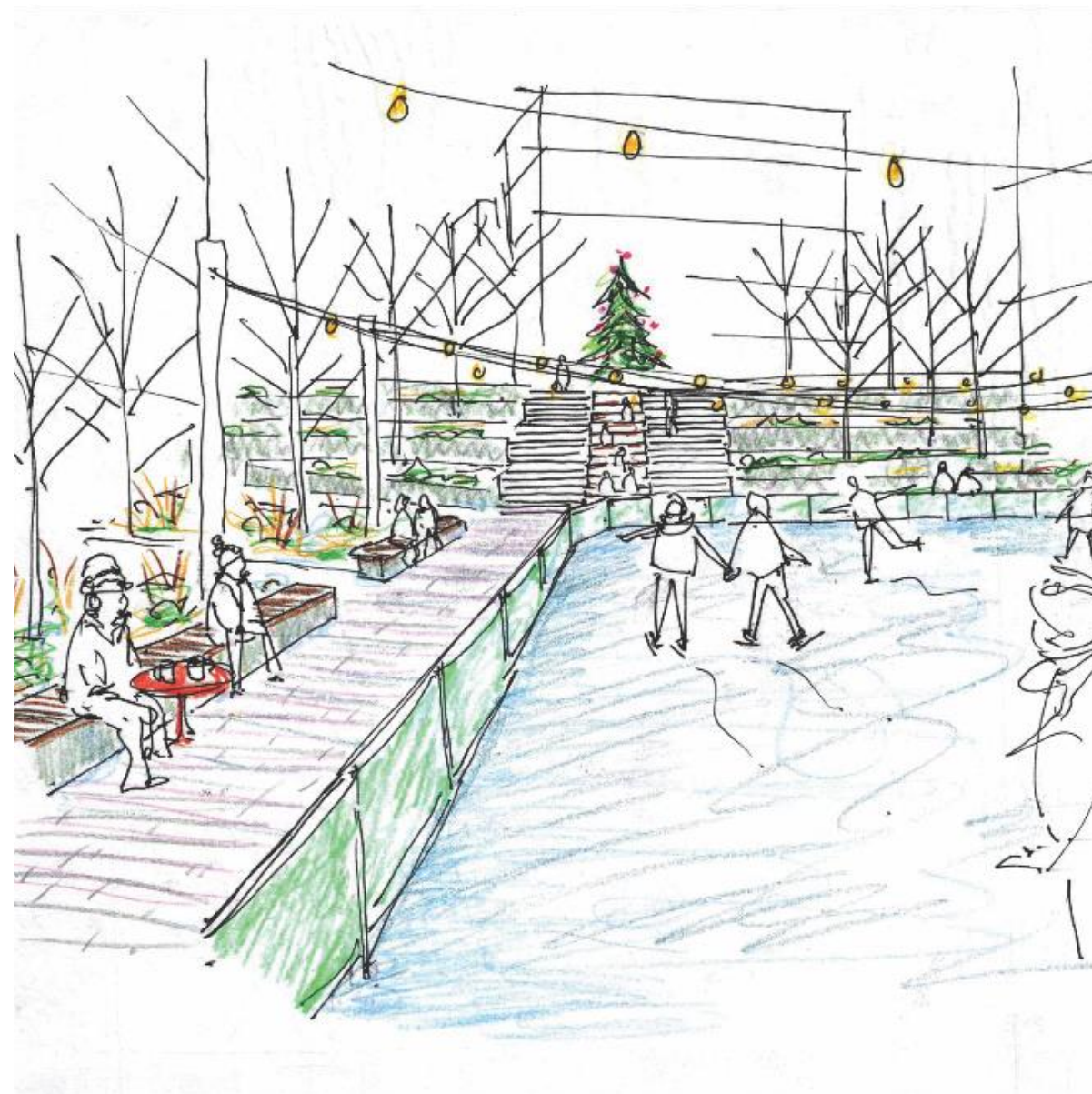
Multi-Use Public Arcade to Enjoy all Year Long